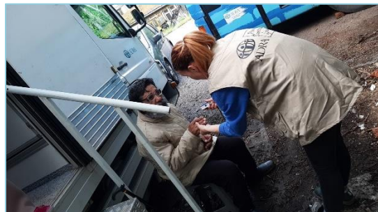
The 5-member team provider showers to around 30 people daily, and health care to 85 people. Hygiene services have to do with health but with dignity, self-respect and give hope. Health care is essential since 75% of beneficiaries are chronic patients, with complicated conditions while all suffer from anxiety hile 50% have mental health issues.

ADRA has been the only civil sector actor in Serbia running comprehensive program of support to homeless who number 3-5,000 individual in Belgrade city only. Only ADRA has actively worked with 4,250 since 2019 and with total of 3,100 in 2022 and 2023 . The focus was on Belgrade and on providing three types of services. First, total of 6744 relief and and WASH services (water, sanitation, health) - mobile and stationary. Second, 6070 health care services including primary care, linking with the health care system, mediation in communication, covering health care costs (since 60% of them do not have health insurance) and following their condition and treatments.