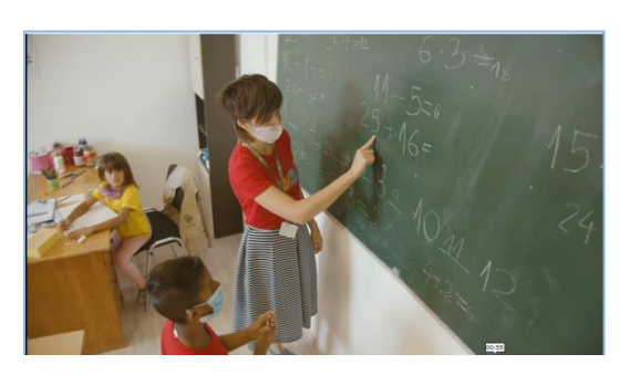
Located in the local community in the settlement of Borča (Belgrade), ADRA`s Community Center entails 660m2 of equipped indoor and 1,200 m2 outdoor spaces - classrooms, women`s center, occupational and recreational spaces - unique resource for play, socializing, educating and preparing for labour market to the most vulnerable families from the community.

specialized organizations of civil societies (OCS), to work with young Roma families. Comprehensive support to families entails working with families to enroll children in primary schools, build their Serbian language skills, support them through assistance in learning, doing homework. In 2019-2023, 250 Roma children of primary and 50 of secondary school will have progressed to the next